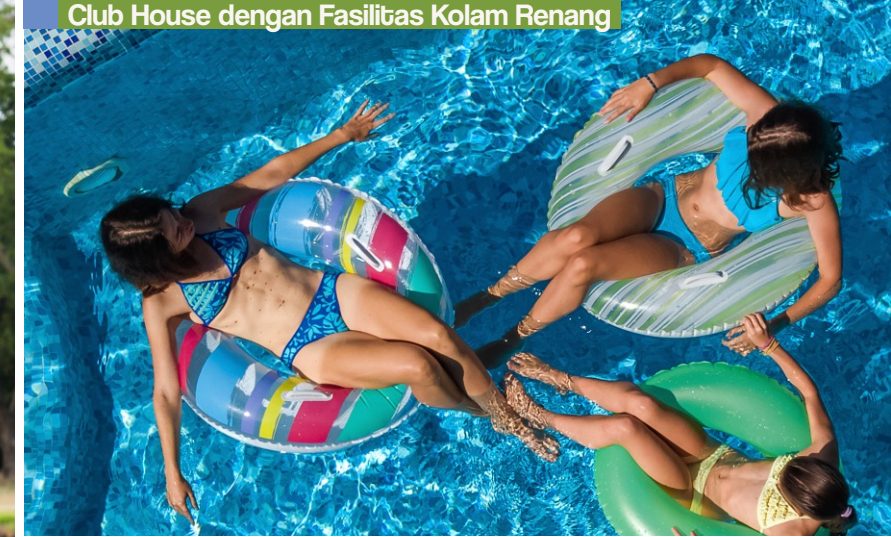
Club House dengan Fasilitas Kolam Renang