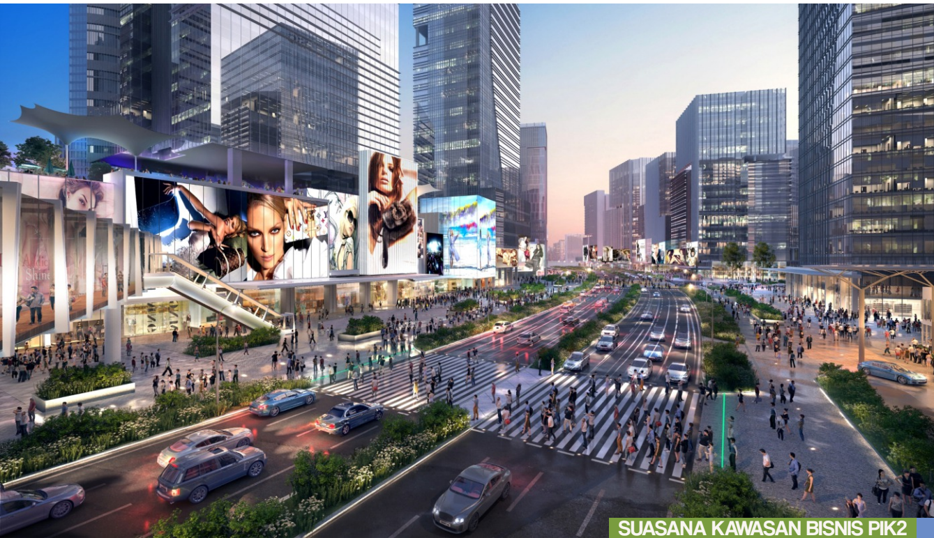
SUASANA KAWASAN BISNIS PIK2