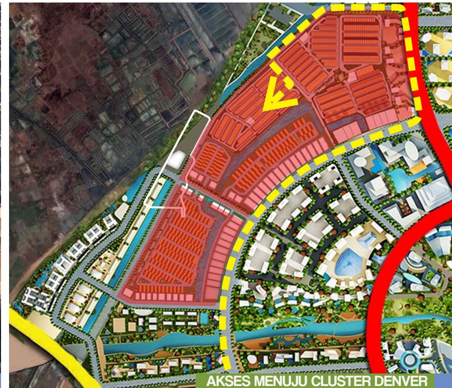
AKSES MENUJU CLUSTER DENVER